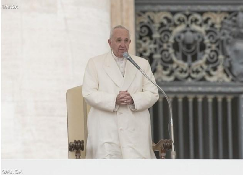
Pope Francis at his Weekly General Audience. 23/03/2016

Dear Brothers and Sisters: As we prepare to celebrate the Paschal Triduum in this Holy Year of Mercy, we are invited in a special way to contemplate the revelation of God's infinite mercy in the events of Jesus' passion, death and resurrection. On, Holy Thursday, Jesus gives himself to us as food and, in the washing of feet, teaches us the need to serve others. On Good Friday, in the mystery of Christ's death on the cross, we contemplate that undying divine love which embraces all mankind and summons us in turn to love one another in the power of the Spirit. Holy Saturday, the day of God's silence, invites us not only to solidarity with all who are abandoned and alone, but also to trust in that faithful love which turns death into life. These, then, are days which speak to us powerfully of God's love and mercy. In one of her visions, Julian of Norwich hears the Lord say that he rejoices eternally because he was able to suffer for our sake out of love. Let us prepare then to celebrate the coming days with gratitude for this great mystery of God's mercy, poured out for us on the cross of our salvation.