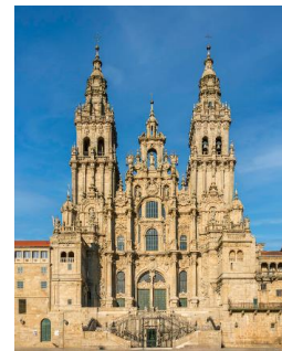
CATHEDRAL OF SANTIAGO DE COMPOSTELA

We started our pilgrimage in the delightful city of Ponferrada , which is home to an interesting old castle ‘Los Templarios Castle’, built to protect pilgrims walking the Camino De Santiago and is named after the Knights Templar who defended the town in the 12 th Century. Each day we commenced our walk early covering approximately 20- 28km through sunshine, wind and rain. The weather was really very temperate (even in the rain) and we hiked through many beautiful old stone towns with cobbled streets and stone-walled paths, as well as forests with lush foliage and singing birds. The well signposted track- ‘spot the yellow arrow’ was always a fun game-meandered through farmland with apples, blackberries, plums and corn with one farmer kindly offering us some of the most delicious grapes I have ever tried. At times the walk was quite challenging with some very long steep climbs with ‘only five kilometres to go’ becoming a catch-phrase of ours. Of course, it was always a satisfying feeling to arrive at the next town at the end of each day to relax, unwind and reflect on what we had seen and experienced. (Continued middle page)