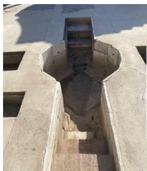
Baptismal Font 4 th Century, Ephesus in the (ruined) Basilica