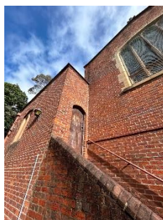
AREA BEHIND SANCTUARY