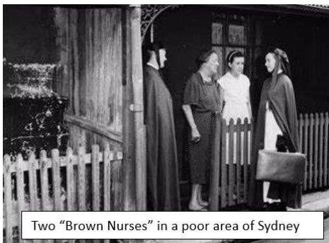
Two "Brown Nurses" in a poor area of Sydney