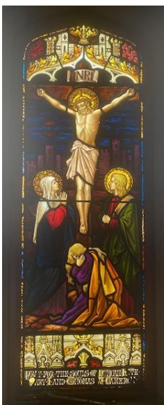
Repairs for external & internal glass