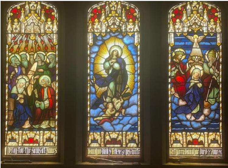
Stained glass needs repairing, plus outside protective glass to be added for two panels, replaced for another panel.

Roof leaks are currently being investigated and the path to the toilets is now “completed” – depending on the tick for satisfaction from our infirm who use the path. PHMSC for Maintenance Committee.