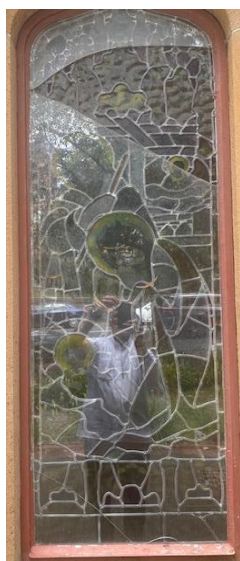
Exterior South Side protective glass broken