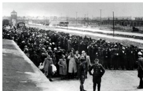
Birkenau on arrival – first "selection". Some went straight to gas chambers.

In Poland, at the risk of their own lives, 66 congregations of nuns in about 450 institutions and 25 male congregations in about 85 institutions, and around 700 diocesan priests in 580 locations in occupied Poland did what they could to assist Jews. 3,000,000 non-Jewish Poles were murdered in camps during the occupation. More light is being brought to bear on the role of the Papacy and the Church/es during this period with the opening of Vatican Archives of the period under Pope Francis. It is complex to say the least as are the historical contexts which allowed Nazism to take such a hold on so many. May our prayer and action also be "Never Again". Peter Hearn msc