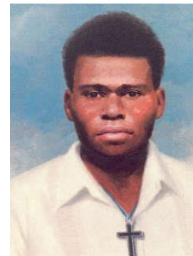
Blessed Peter To Rot