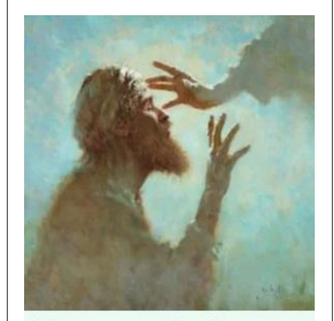
Master, grant that I may see