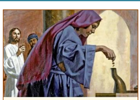
This poor widow has put in more than all who contributed.